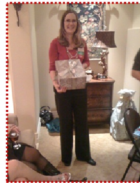
Ms Vanna White.... Also known as Anne Grimes.